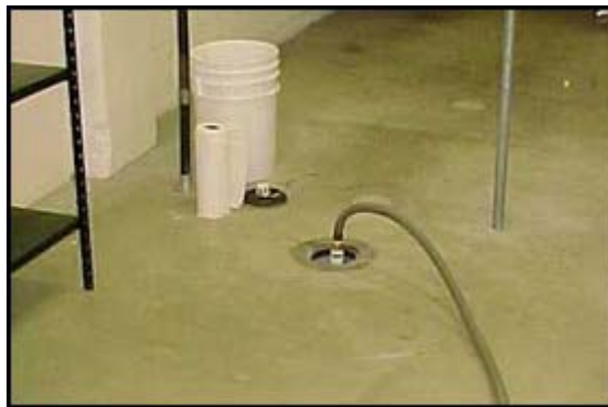
Inoculation in Progress

CL-out was introduced through one-inch diameter piezometers that were installed using a direct push sampler. The small diameter injection points made it possible to install injection points inside the cleaners without disrupting the facility operations. Eight injection points were installed to cover the area of the groundwater plume. The first CL-out inoculation on August 18, 2000 was a high dose of five drums to establish the CL-out microbe population within the treatment zone. a smaller inoculation, of three drums, was introduced after one and two months to maintain the CL-out microbial activity.