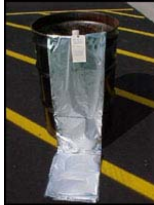
CL-out Bottle Bag