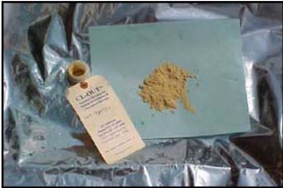
Freeze-dried CL-out Culture