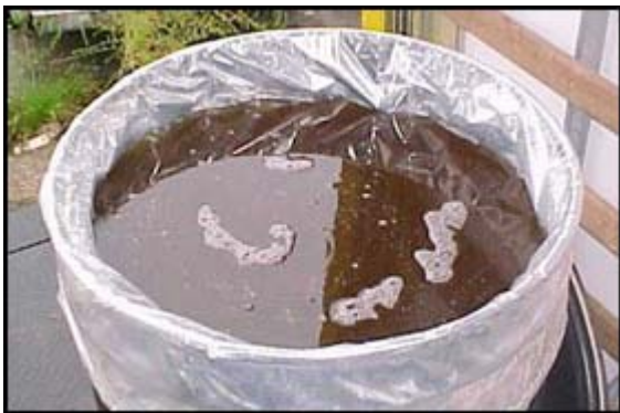
CL-out Hydrated and Ready to Inject